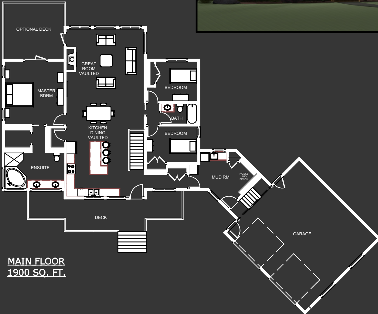
MAIN FLOOR 1900 SQ. FT.