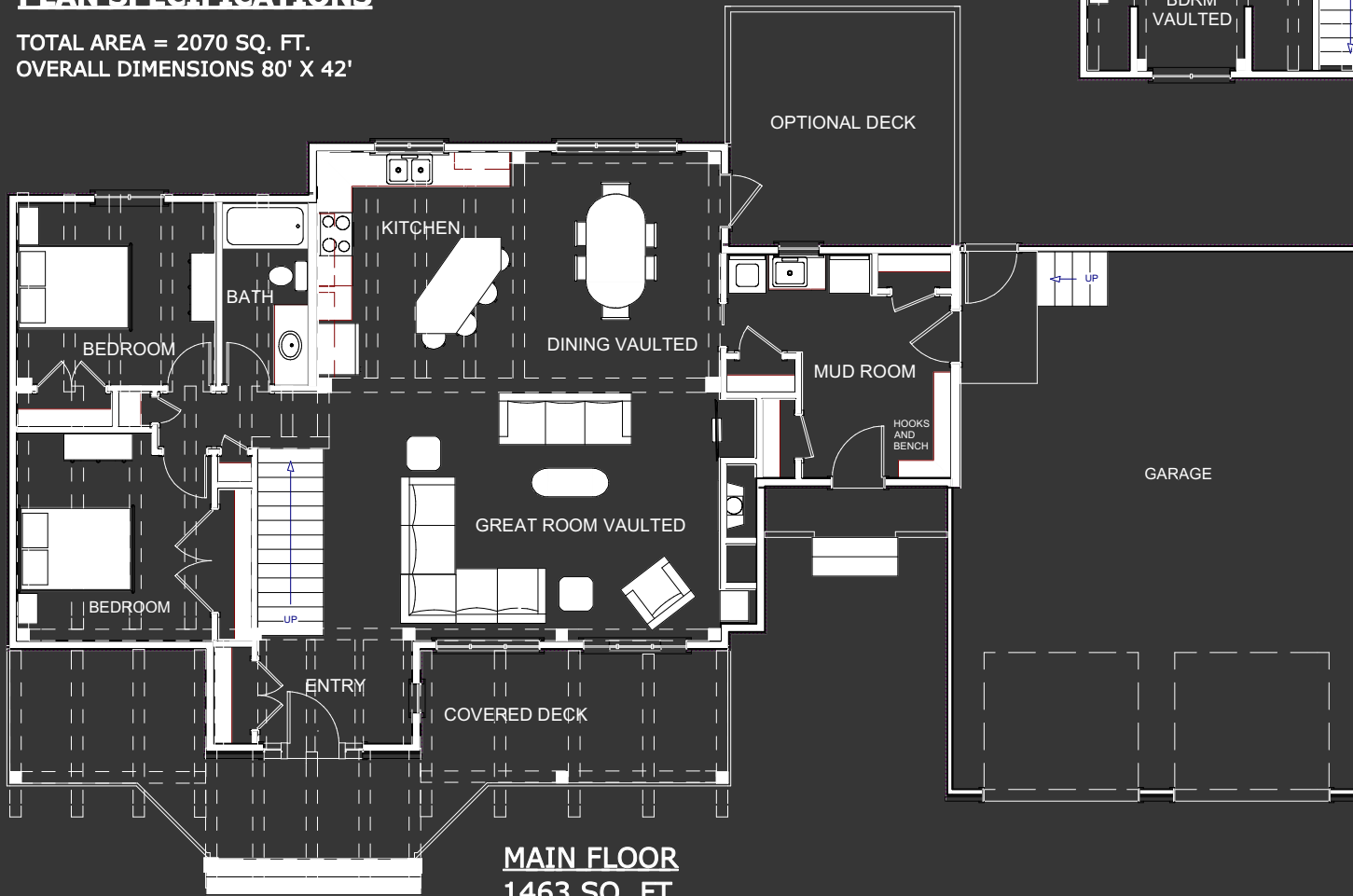
MAIN FLOOR 1463 SQ. FT.

TOTAL AREA = 2070 SQ. FT. OVERALL DIMENSIONS 80' X 42'