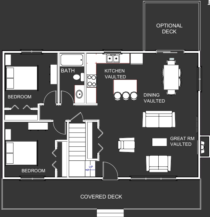
MAIN FLOOR 1040 SQ. FT.